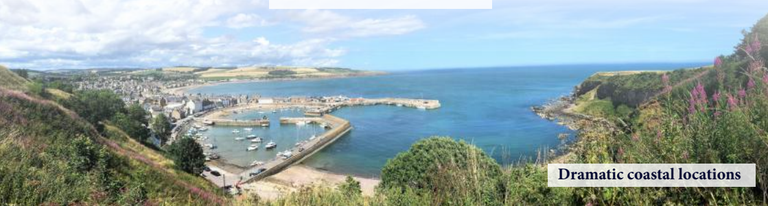
Dramatic coastal locations