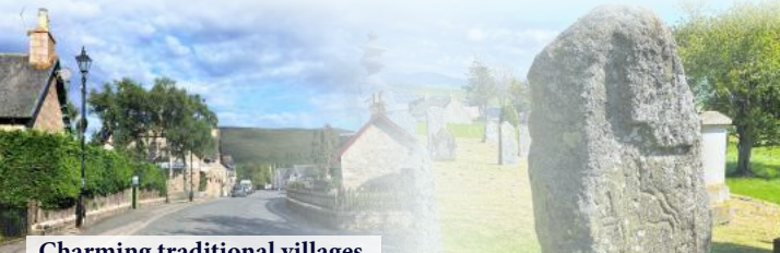
Charming traditional villages