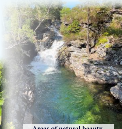
Areas of natural beauty